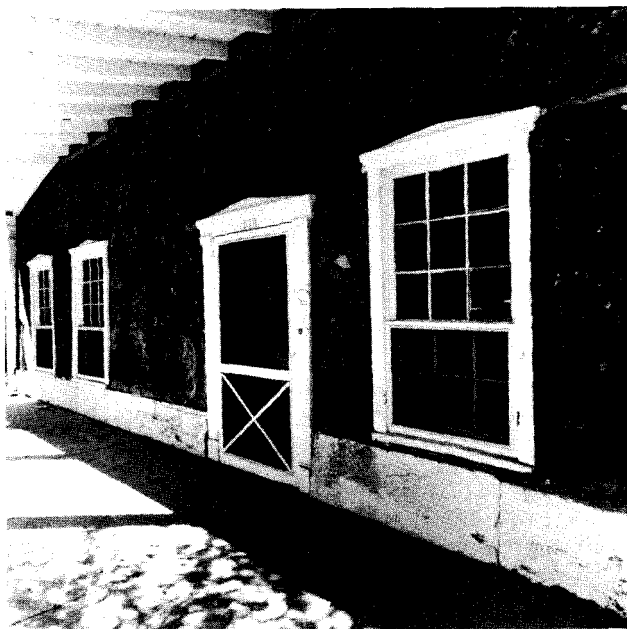
Front facade of the Tully House ready to be replastered. Hope Curtis