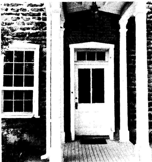
Simulated brick wall finish which was discovered under south side porch. Hope Curtis