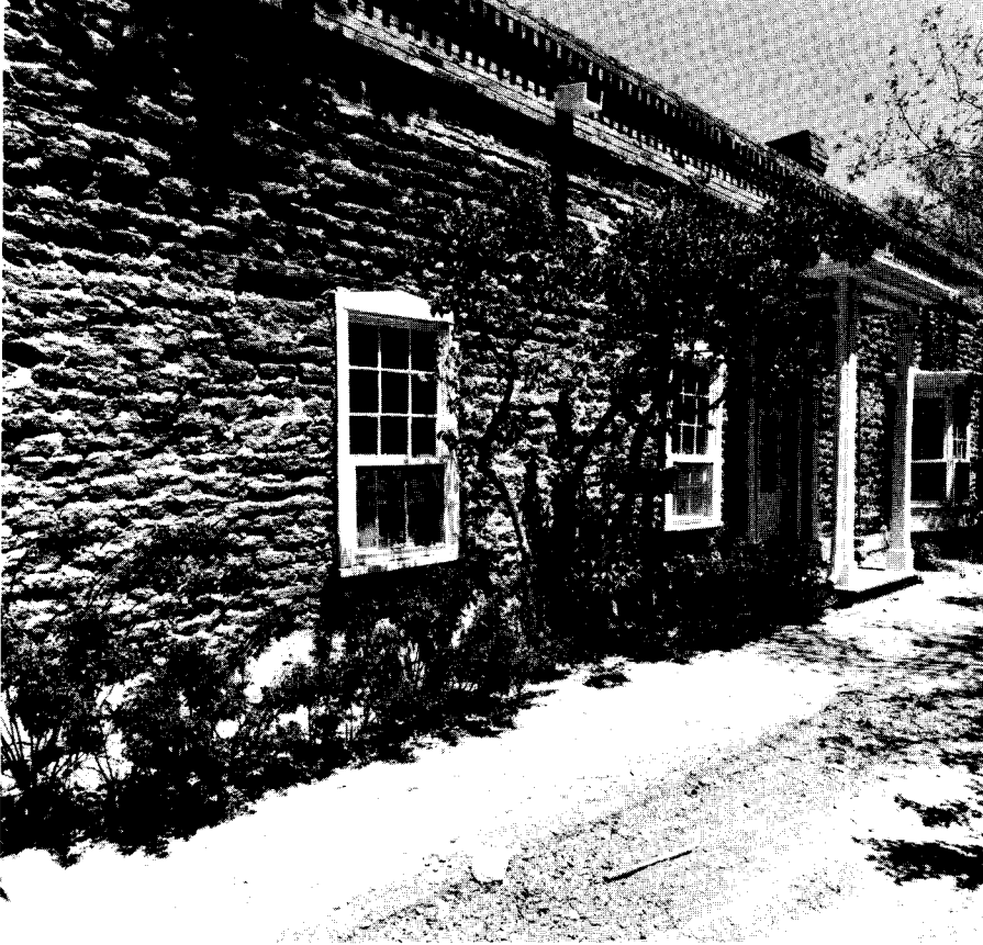
South side of the Tully House showing exposed adobe. Hope Curtis