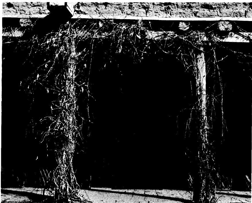
The Ignacio de Roybal House