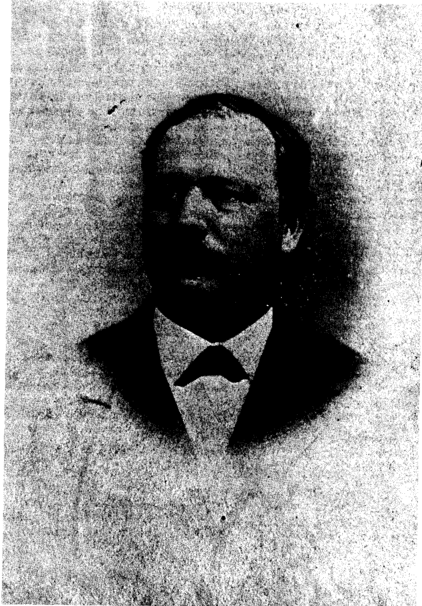
William H. Manderfield