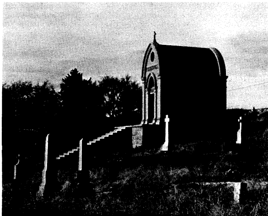
The Manderfield Mausoleum Rosario Cemetery