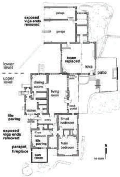
Henderson House floor plan sketch with changes made to the house after 1938 indicated in bold face text. Drawing by Catherine Colby.

which he traveled in Europe from 1901 to 1903, taking in the continent's art collections at his own speed.