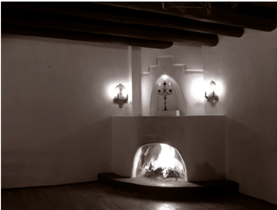
William Penhallow Henderson House, Fireplace in Kiva Room.