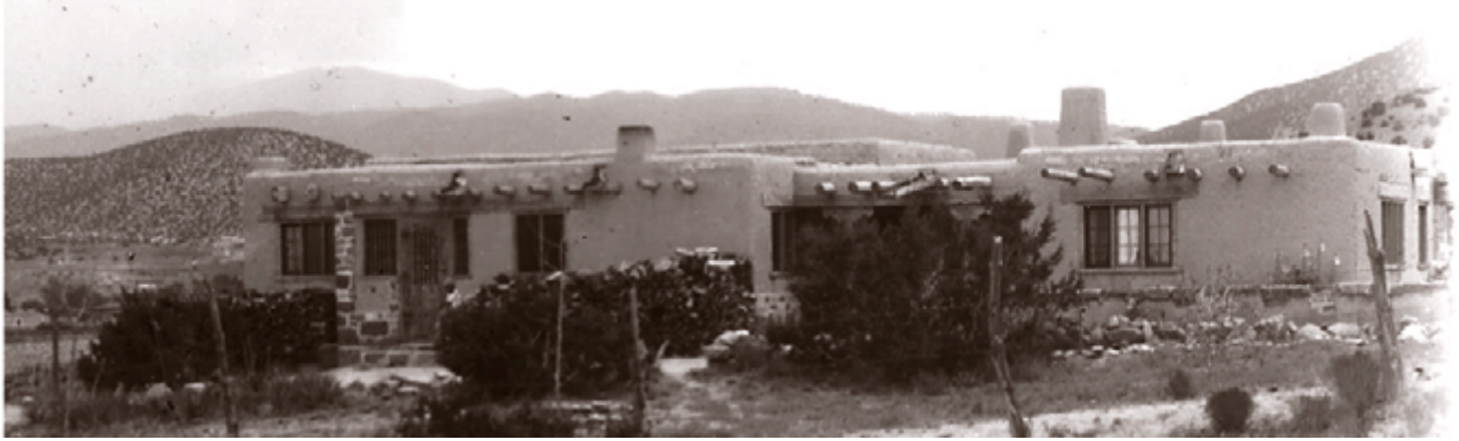
Top, the Henderson house before construction of the apartment at the lower level. Detail of Photograph Courtesy Museum of New Mexico (Neg. No. 13343.) In the recent photo below, the protruding viga ends on the south end have been cut. Photo © Steve Northup.