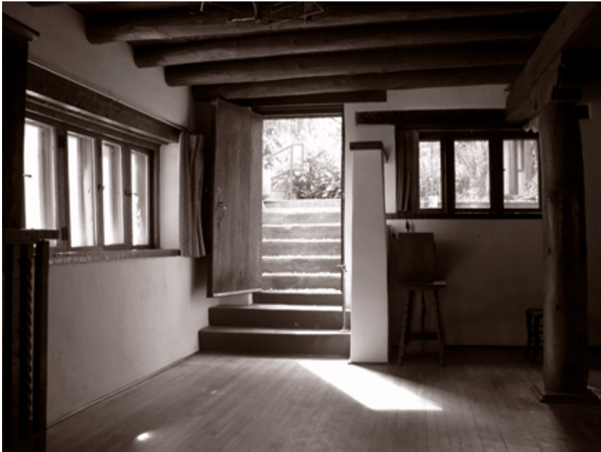
Kiva Entrance.