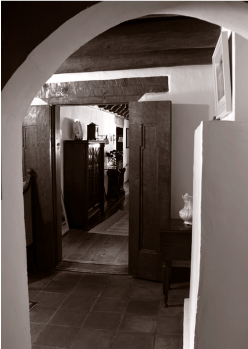
Living Room Doors.

His portrait subjects also included local Hispanic people.