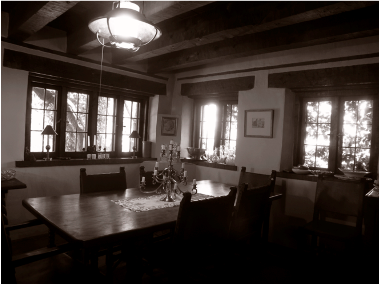
Dining Room.

and eight side chairs bear carved decorations—Henderson's characteristic floral rosettes as well as zigzags, and triangles—arranged in a modernist style.