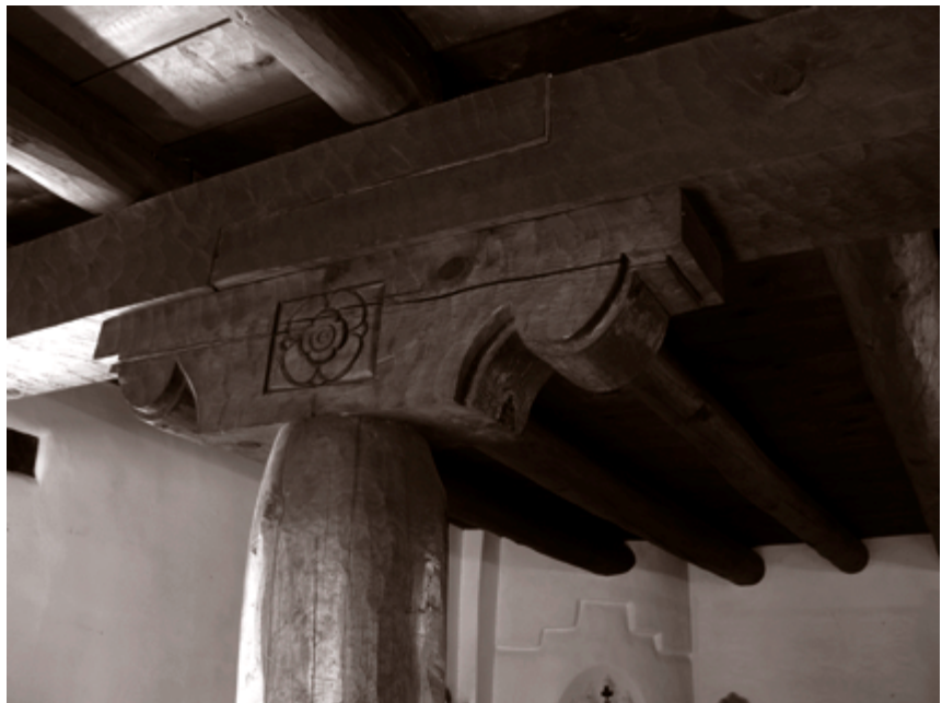
Carved beams and posts in the Kiva. Opposite, radiator covers with carved spindles.

A wonderful example is the eight-foot table on display at Owings-Dewey Fine Art in Santa Fe. The table is of the trestle-type with heavy connecting pieces, the lower one thickly rope-carved. Two tall-backed captain's chairs