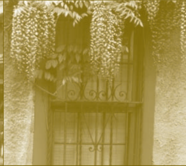
Tudesqui House