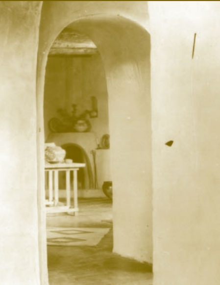
Sheldon Parsons House Courtesy Palace of the Governors (MNMCDA) #135232