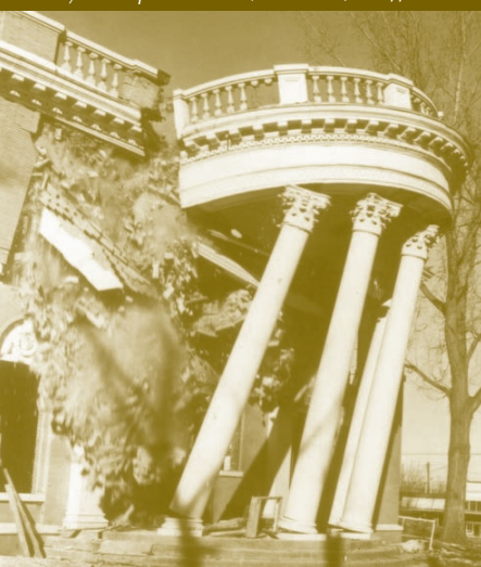
Demolition of Governor's Mansion #56414

Against these losses, the Foundation has worked since its founding in 1961 to own, preserve and maintain historic properties within the city and to educate the public as to the value of preservation. In response to the alarming loss of our heritage, the Foundation established an Endowment Fund in 2004 to further our efforts in heritage conservation. Your generous gift to the Endowment will allow us to continue our work for decades to come.