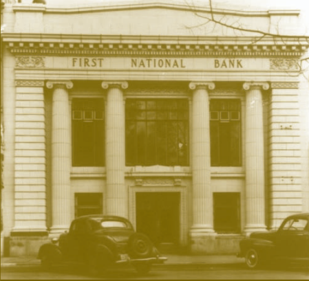
First National Bank #10640