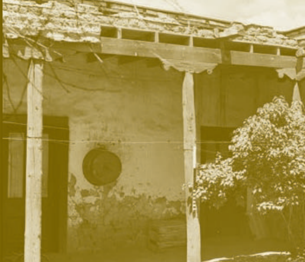
Garcia House, Closson Street