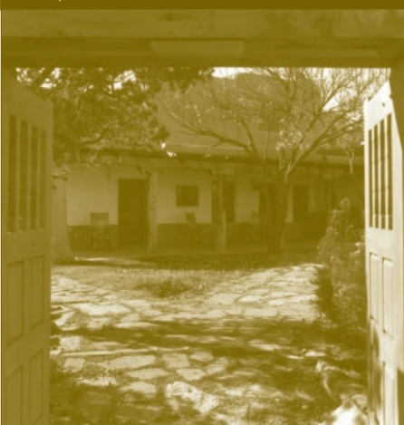
Carlos Vierra House