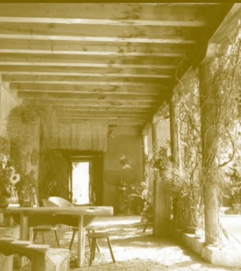
Donaciano Vigil House