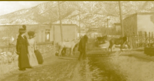
Canyon Road, undated