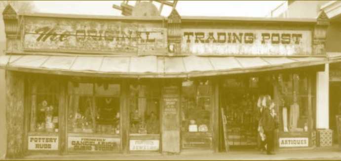
J.S. Candelario's "Original Old Curio Store"