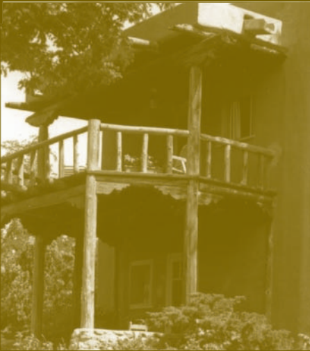
Witter Bynner House