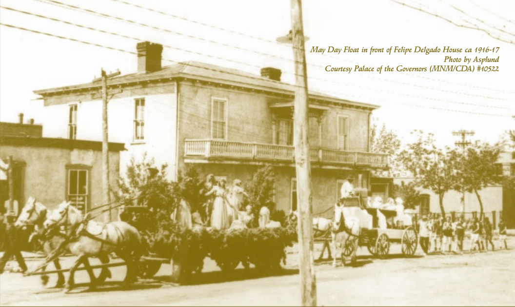
May Day Float in front of Felipe Delgado House ca 1916-17 #10522