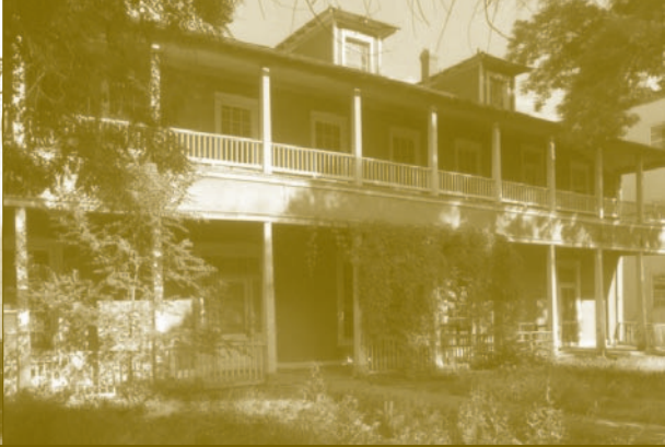
Nusbaum Building, Photo by Tyler Dingee Courtesy Palace of the Governors (MNMCDA) #91901