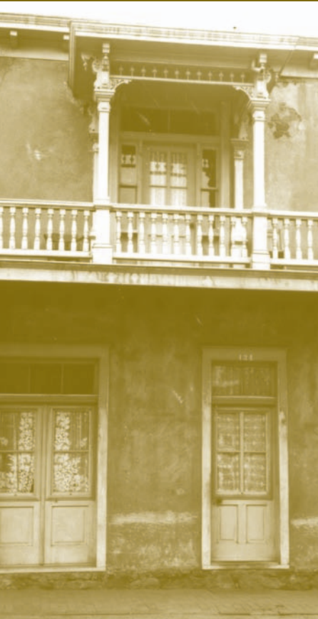
Felipe Delgado House ca 1920s-1930s, Photo by H. Sage Goodwin Courtesy Palace of the Governors (MNMI/CDA) #119355