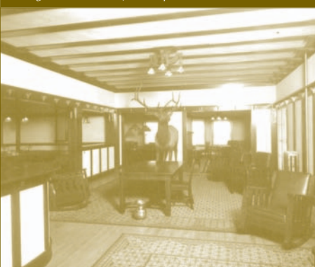
Elles' Club Interior, Lincoln Avenue, 1912, Photo by Jesse Nusbaum Courtesy Palace of the Governors (MNMCDA) #61370

Other examples of early buildings erased forever from the city's historic core include the Loretto Academy grade school and the 19th-century Curry House in the Barrio de Analco.