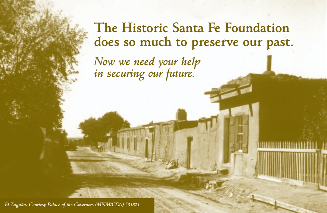
El Zaguán, Courtesy Palace of the Governors (MNMC/DA) #31821

Now we need your help in securing our future.