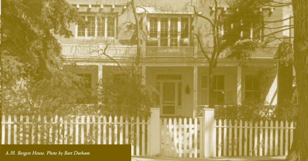
A.M. Bergere House.