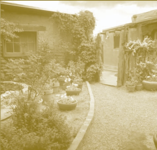
Boyle House.