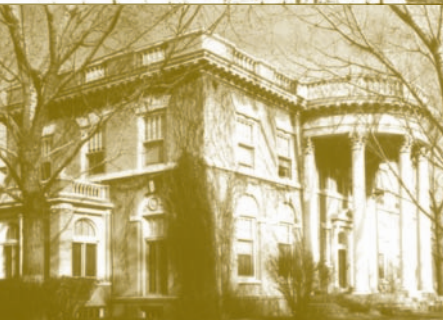
Governor's Mansion, Photo by T. Harmon Parkhurst Courtesy Palace of the Governors (MNM/CDA) #10244