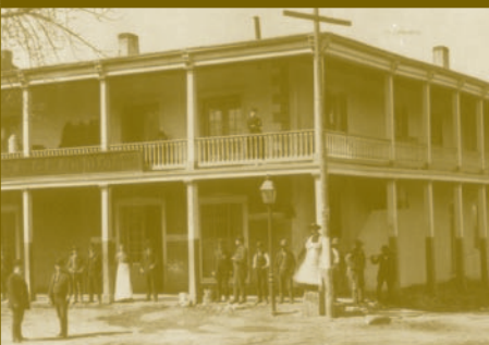
Hotel Capital, Photo by J.R. Riddle Courtesy Palace of the Governors (MNMCDA) #56237