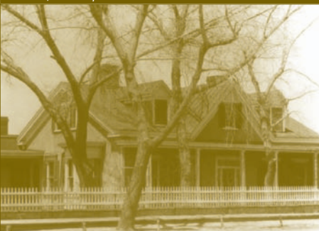
Commanding Officers' Quarters also M.A. Otero Residence 1879-1908 on Washington Avenue