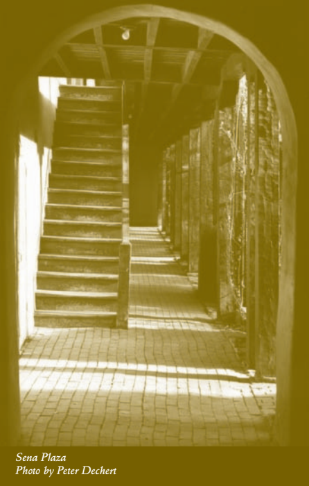
Sena Plaza