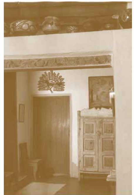
Olive Rush Home and Studio

Our annual Business Meeting will take place on Thursday, June 25th at 4:30. This meeting is often combined with a Garden Party but this year we're conserving our resources to host a Fountain Re-Dedication Party at El Zaguán beginning at 5:45, on Friday, September 18th.