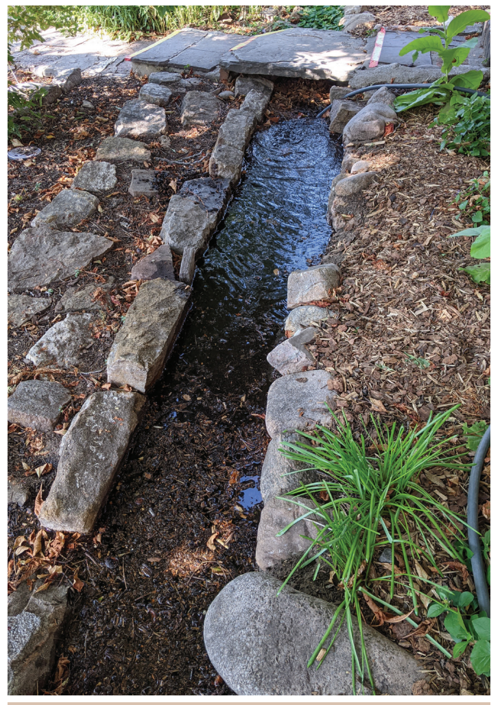
Running water through the existing ditch at El Zaguán to demonstrate the acequia exhibition.