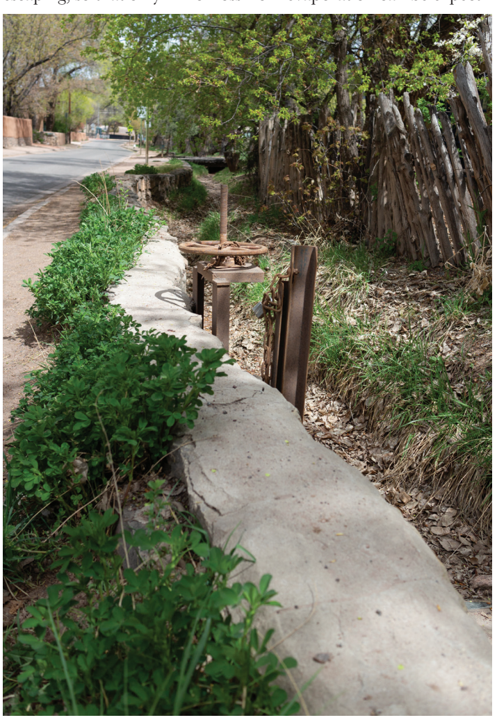
Headgate from Acequia Madre as an example of a similar device that will be installed at El Zaguán for an example of a functing acequia.

In addition to the acequia restoration, the project will include the reconstruction of the stone steps leading from the portal, across the acequia and into the garden. At this same time, any repairs which might be needed to pathways and brick edging in the garden will be accomplished. When complete, the El Zaguán Garden will be even more effective as an attractor to visitors and as a vehicle for inspiring the public about the importance of historic preservation.