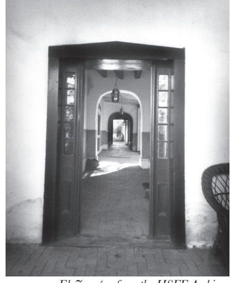
El Zaguán

A guiding principle of the El Zaguán Master Plan is a recommendation that all characterdefining features should be diligently