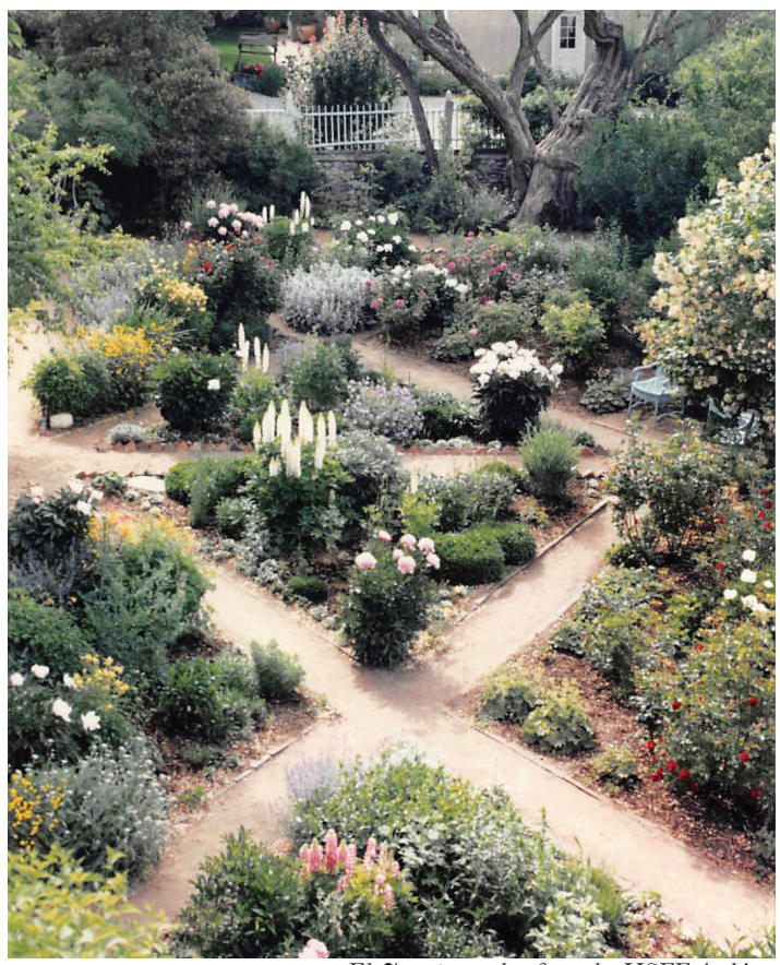
El Zaguán garden

tion in the apartments and current office/public space are under consideration to reflect the best use of the property going forward. This must entail a budget(s) and capital plan for the transition over time.