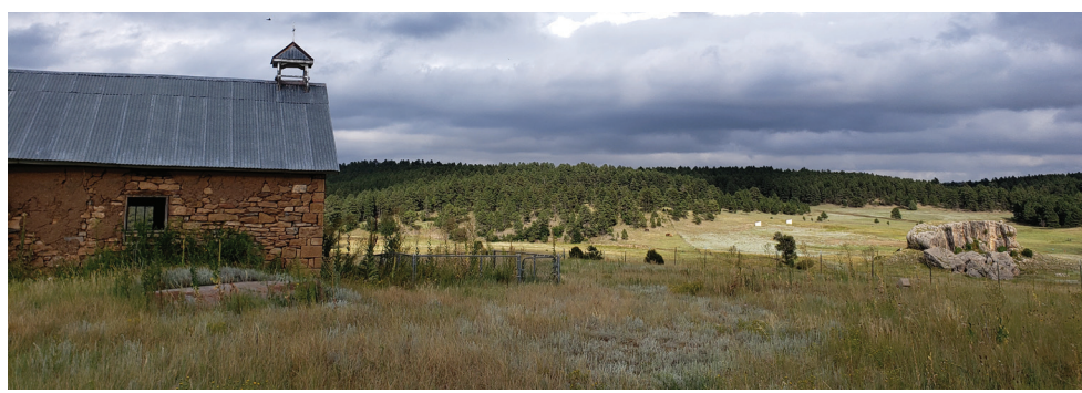
San Isidro, Sapello

Historic Santa Fe Foundation 545 Canyon Road Suite 2 Santa Fe, NM 87501 info@historicsantafe.org historicsantafe.org 505.983.2567